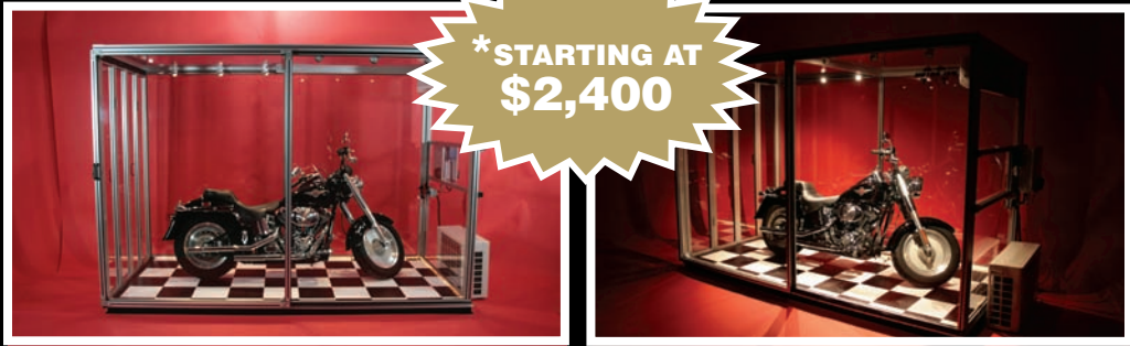
Turn Your Garage Into a Showroom